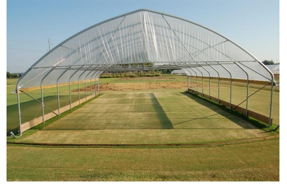
Rainout shelters are already installed at three locations (see map)